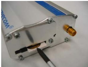
Push SIM card all the way in until click